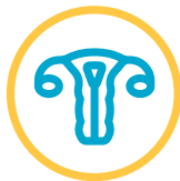
Gynaecological cancers (cervical, ovarian, uterine)