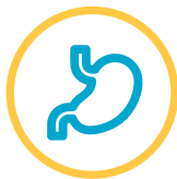
Gastrointestinal cancers (oesophageal, stomach, colorectal, pancreatic, liver and gallbladder)