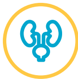
Urological cancers (prostate, bladder, kidney, testicular)